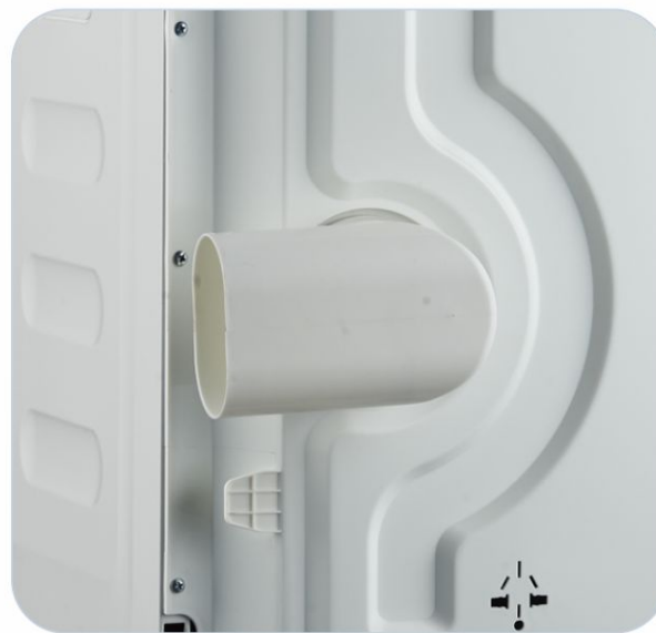
Back exhaust Vent