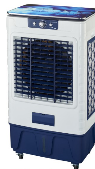
FLYR-80 (Glass top lid ,metal bracket )