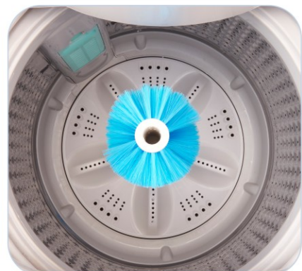
Integral brush type