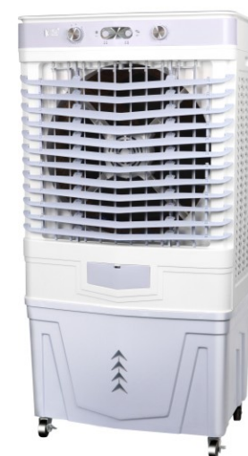
FLYR-8000-121 (Plastic top lid )