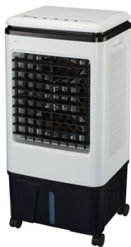
FLYR-30R (Plastic top lid ) (Remote control)