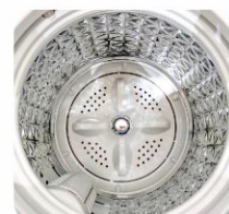
Stainless steel bucket + Plastic impeller