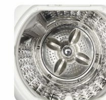
Stainless steel bucket + Stainless steel impeller