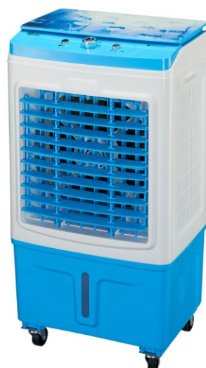
FLYR-40 (Glass top lid )