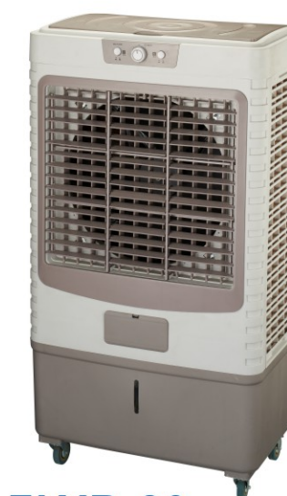
FLYR-80 (Plastic top lid ,metal bracket )