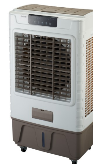
FLYR-80R (Remote control) (Glass top lid ,metal bracket )