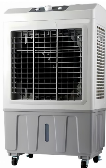
FLYR-5000-2 (High tank, metal bracket )