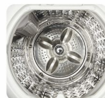
Stainless steel bucket + Stainless steel impeller