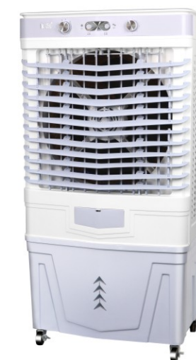
FLYR-8000-121-1 (Glass top lid )