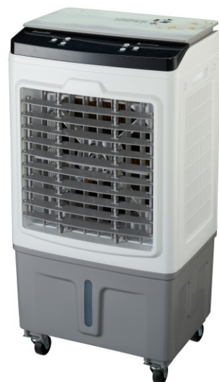
FLYR-40R (Plastic top lid ) (Remote control)