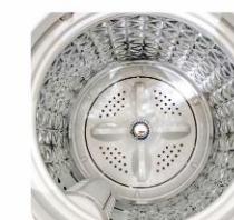
Stainless steel bucket + Plastic impeller