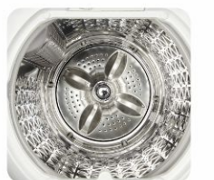
Stainless steel bucket + Stainless steel impeller