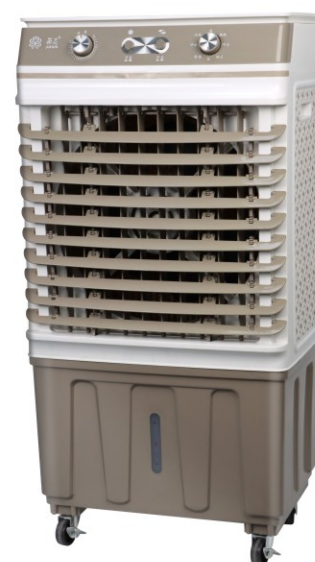
FLYR-5000-101 (Glass top lid )