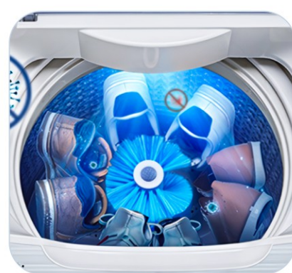
2 IN 1